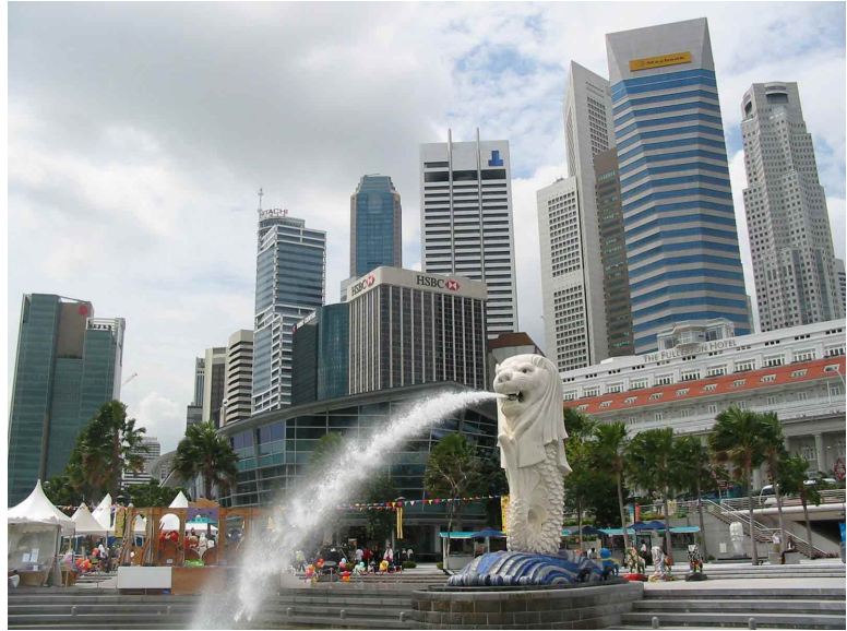
Singapore was one of the stops on Bridget's vacation.