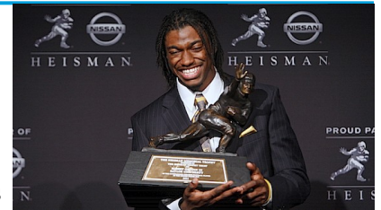
Robert Griffin III accepts the 2011 Heisman Trophy.